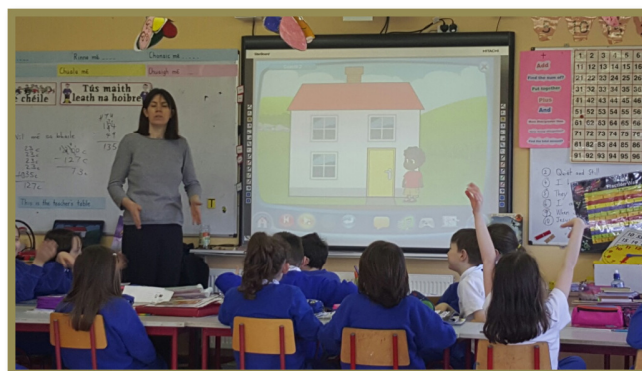
Enjoying Irish class