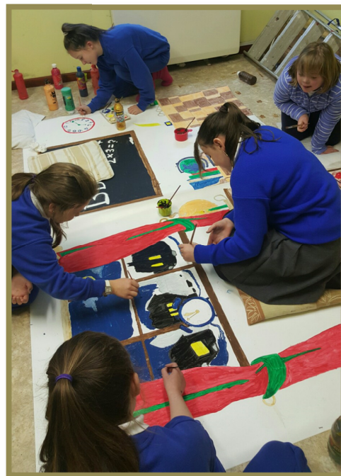
Painting the backdrop for the Christmas play