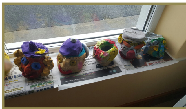
A selection of pupils' pottery