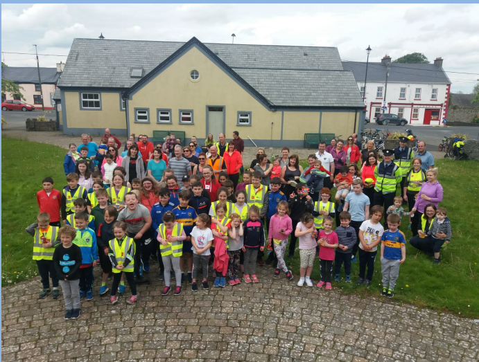
Fun Run/Walk/Cycle, May 2018

All our pupils were very active at breaktimes due to newly purchased sports equipment. Our fun walk/run/cycle in Toomevara was a major success. Well done to all the pupils who participated so enthusiastically. We hope to raise the flag in the autumn.